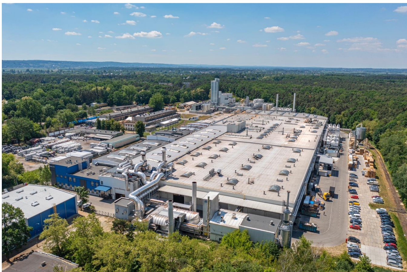
Fig. 1. A view of Kronospan HPL Sp. z o. o. in Pustków (Poland).

Kronospan Compact Interior CGS boards are manufactured in Pustków. In 1996, Kronospan started its operations there. The factory was established on the basis of one of the then existing departments of the local company - the laminate production department. In 1996-2006, the company underwent a series of complex technological changes related to the production of laminates. As a result of these changes, a new production plant was established, which uses the latest technological, technical and product solutions in the production of decorative laminates, countertops, compact boards or facade panels.