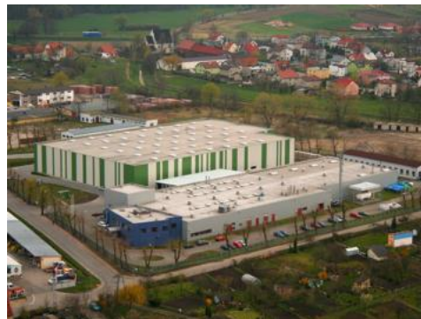
Fig. 1. The view of Armacell Poland Sp. z o.o. factory in Środa Śląska.

The Armacell Poland Sp. z o.o. factory in Środa Śląska is one of 20 owned by Armacell International and is specialized in production of technical insulation systems (Armaflex, Armafix, Tubolit), protective systems (Arma-Check), metallic protective systems (Okabell), acoustic insulation systems (Armaflex Tubolit and ArmaComfort), fire protection systems (Armaflex), adhesives and accessories.