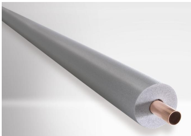
Fig. 2. Tubolit DG Plus insulation.

According to the European Chemicals regulation (REACH) manufacturer, importers and downstream users must register their chemicals and are responsible for their safe use on their own. For its production Armacell uses registered and approved substances/mixtures. Tubolit DG Plus does not contain substances to be mentioned according to EU regulation No 1907/2006 (REACH) annex II.