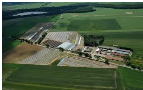
Fig 1. A view of Kompozycje Ozdobne - Karwice Sp. z o.o. in Karwice (Poland).

Nature Impact A/S is a Danish company that produces and delivers concept-based systems solution within green roofs and plant walls. Nature Impact was founded by the Larsen family in 2013. The family has been in the gardening and horticulture industry for 5 generations. Nature Impact A/S's nursery, Kompozycje Ozdobne - Karwice Sp z o. o., is located in north Poland.