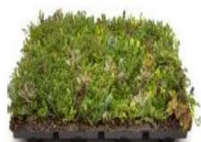
Fig 2. A view of Nature Roof Standard 60/25 module.

Nature Roof Standard 60/25 consists of plastic trays, substrate and plants – at least 8-12 species of sedum, 4 to 6 of them are naturally occurring species in Danish vegetation. Coverage minimum 90%. Can be applied to roofs with a slope of 0 to 25 degrees (above 14 degrees support profiles should be installed). The characteristics of the Nature Roof Standard 60/25 is presented in Tables 1 and 2.